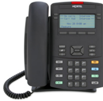
1220 Part # NTYS19BA