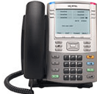
1140E Part # NTYS05AC