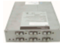
BCM Fiber Expansion Media Bay Module Part # NT7B07AAAC