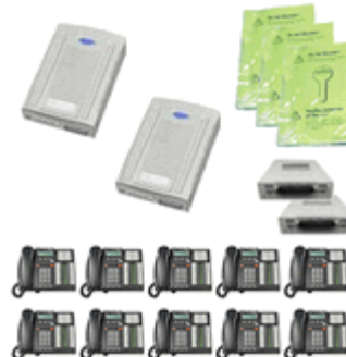
BCM 50 Package #3: PRI/T-1, Voicemail