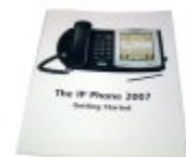
Nortel i2007 User Guide Kit

Two (2) Year Limited Warranty on Repairs, New and Remanufactured Equipment