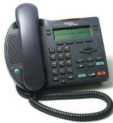
i2002 Part # NTDU76