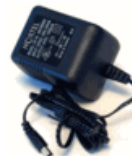
Nortel IP Power Supply