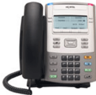
1120E Part # NTYS03BC