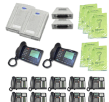
BCM 50 Package #4: PRI/T1, Voicemail, Unified Messaging, IP Telephony

Two (2) Year Limited Warranty on Repairs, New and Remanufactured Equipment