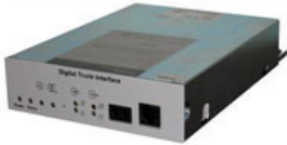
BCM Digital Trunk Module T-1/PRI Media Bay Part # NT5B04AAAD