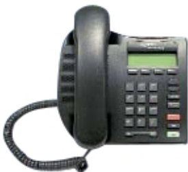
i2001 Part # NTDU90AB70 / Part # NTDU90AA16