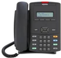
1210 Part # NTYS18AA