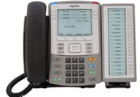
1100 Expansion Module Part # NTYS08AA