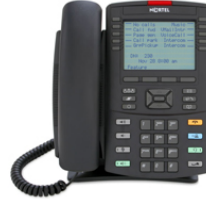
1230 Part # NTYS20BA