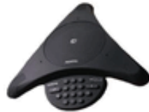
NORTEL NORSTAR AUDIO CONFERENCING UNIT (NTAB2666)