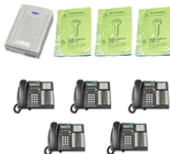
BCM 50 Starter Package #2 with Voicemail