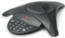
NORTEL DIGITAL CONFERENCING UNIT (NTAB4213)