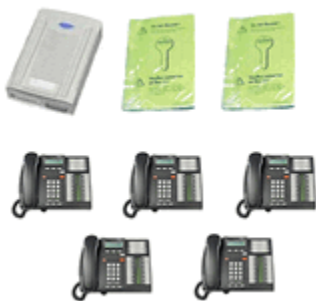
BCM 50 Starter Package #1