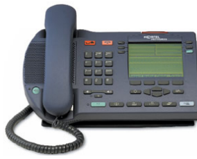
i2004 Part # NTDU82