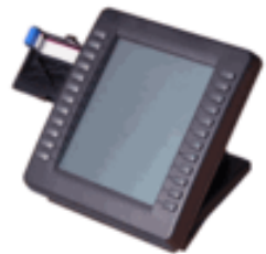
i2000 Key Expansion Module Part # NTEX00DA

Two (2) Year Limited Warranty on Repairs, New and Remanufactured Equipment