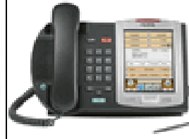
i2007 Part # NTDU96