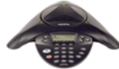
NORTEL 2033 IP CONFERENCE PHONE (NTEX11BA70)