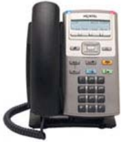
1110 Part # NTYS02BA